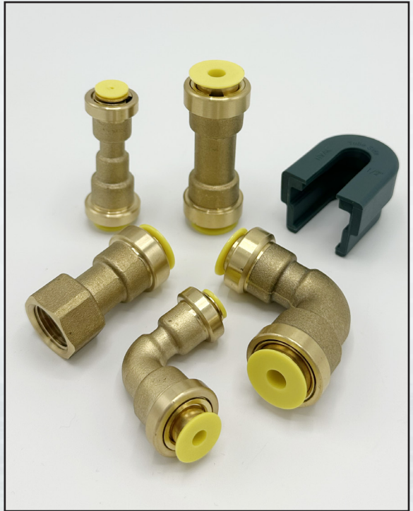
* Remove yellow dust caps prior to installation.